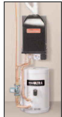
Contender w/ ????

The Contender is designed for easy access to all components from the front and sides quick service.