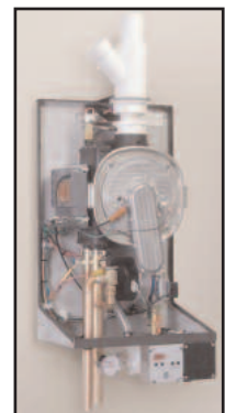
Contender w/out Cover